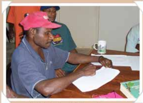
Reading Scripture in his own language

Pioneer Bible Translators desires to accommodate this growth with a building expansion that will allow nationals and missionaries to work side by side in our offices. You can make a difference if you . . .