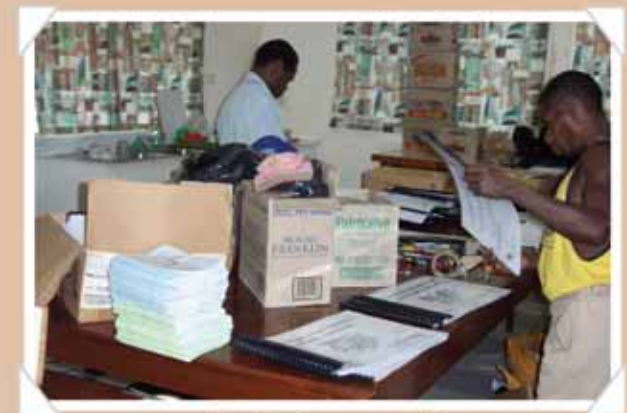
Checking literacy materials

Pioneer Bible Translators desires to accommodate this growth with a building expansion that will allow nationals and missionaries to work side by side in our offices. You can make a difference if you . . .