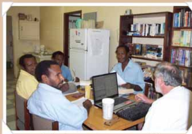
Checking Scripture wherever space is available

Pray. Talk to other members of your church. Become an advocate for this project among family and friends.