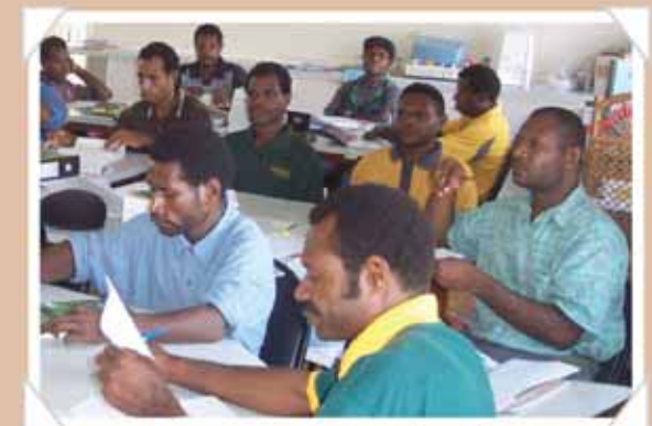
Participating in a writers' workshop