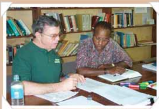
Checking Scripture with a PBT missionary

Consider forming a work team from your church or joining an existing team to come to PNG and help with the construction of our new facility.