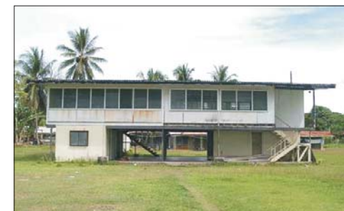
Potential training center needing your help to acquire and renovate it!

The kinds of training that benefit from having larger groups and which PBT is planning to implement include: translation courses/workshops, Biblical studies (for training translators and pastors), literacy curriculum and materials production workshops, community development workshops, and leadership training seminars."