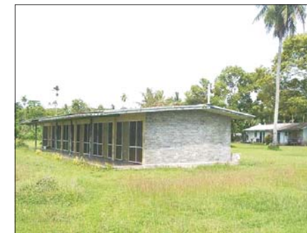
Potential dormitory (1 of 4) holding 20 potential students each

have identified some property that would be ideal for the purposes described above, but there are two obstacles: One is that the property is currently unavailable, and the second is that, if it were to become available, we could not afford it! We are certain that it will cost at least $200,000, but the figure will probably be much higher than that. Now, to us these obstacles may seem insurmountable, but to a God who owns everything, this is "something nothing" as they might say in Melanesian Pidgin. Pray with us about this. We definitely will need a property in order to go forward with this dream. Please pray that God will open the doors directing us to the property best suited for His purposes. Discuss it with your mission committees and VBS planners. A thousand churches or individuals raising $200 would do it. Two hundred churches or individuals raising $1,000 would do it. There are a number of ways it can be done. My question is this, "Do you want to be a part of it?"