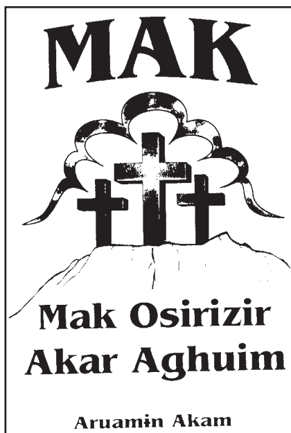
Cover of the Aruamu Gospel of Mark

The day of dedication and celebration was under the guidance of the Literacy Committee. This included preparation of the grounds, building shelters, decorations, food planning, nine speakers, dancers and singers.