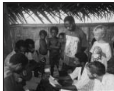
Practicing some new songs from the newly published Nend songbook

The youth group sang until sunrise. (We "old folks" went to bed at 3 am.) It was so awesome