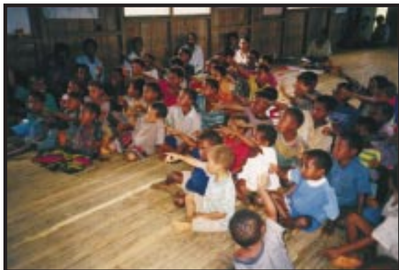
Onobasulu children in school